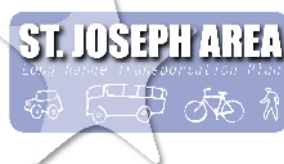
Figure x-x September 2008 Transit Routes