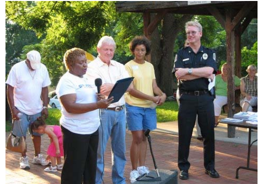
National Night Out August 5, 2008

In place of individual neighborhood watch meetings this month, several groups joined together to have the first National Night Out event held August 5 th at Sherwood Park. Members of the Central, Sherwood, Harris-Kemper, and Mitchell Park 33-37 watch groups participated in the event which was attended by over 200 people along with various units from the police and fire departments. The watch groups held a raffle to help the police department purchase an additional dog for the K-9 unit. On August 22 nd a check for $ 1,500 was presented to the department